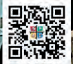
Table and Raffle Tickets on sale through OneCause